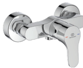
Shower mixer - wall mounted BC842AA