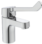
Basin mixer - 80mm, long lever BD061AA