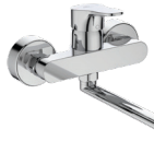
Sink mixer - 200mm, wall mounted BD488AA